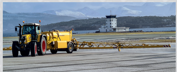
Spray with and without boom